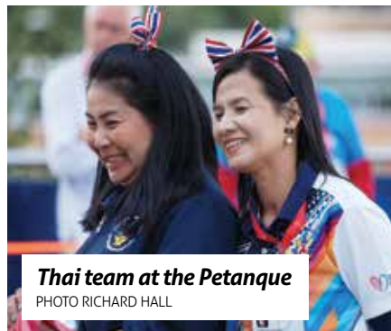
Thai team at the Petanque