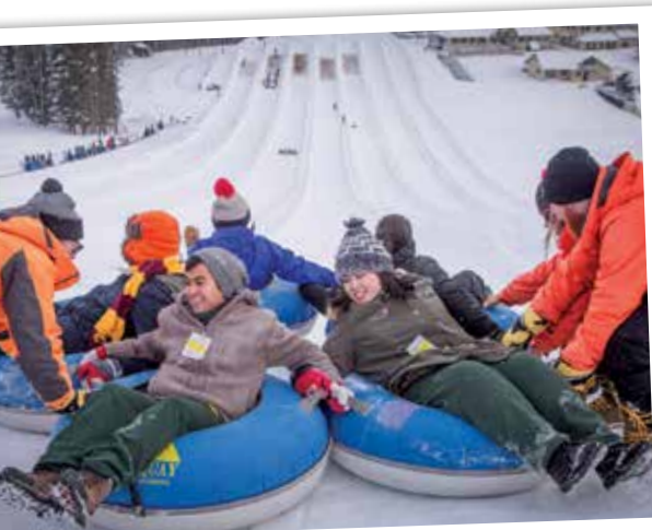
Tubing on Mt Norquay