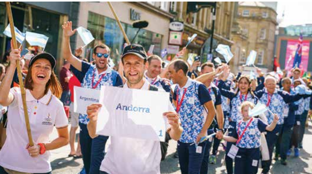
New country Andorra at Athletes Parade