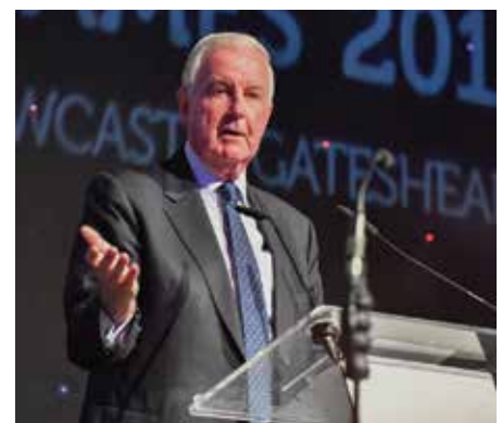
Sir Craig Reddie, International Olympic Committee representative. WTGF guest speaker at the Opening Ceremony