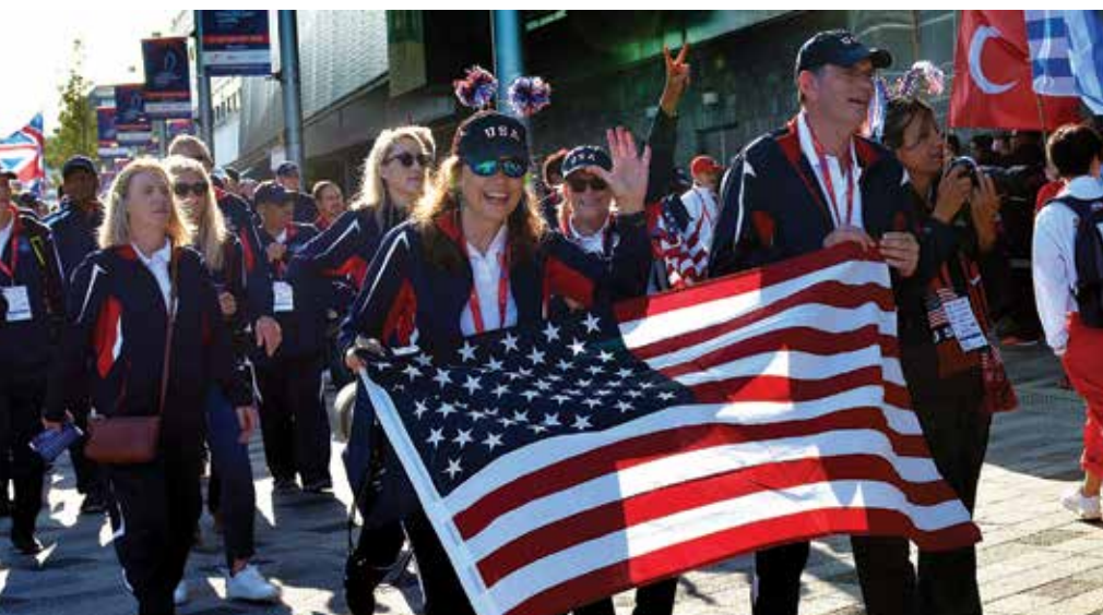
Team USA in the athletes' parade – see you in Houston!