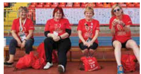
Four of the volunteers from Team 19 taking a well-earned break at the track