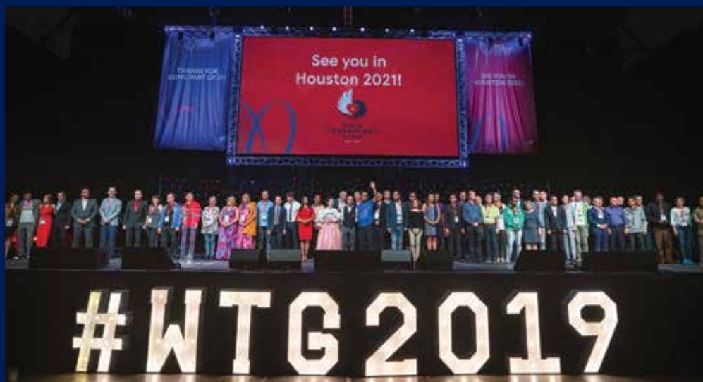
The hard-working 2019 team managers