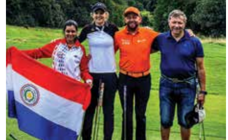
Golfers at Close House Golf Course