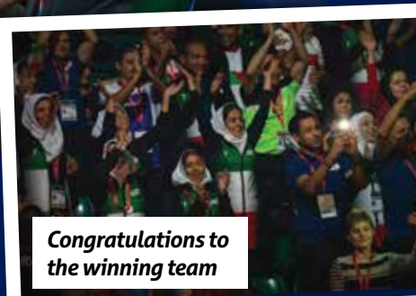
Congratulations to the winning team