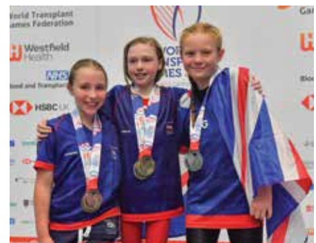
A 'Full House' for the home team