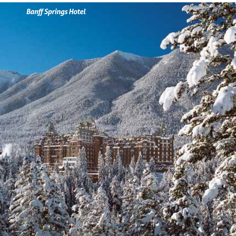
Banff Springs Hotel