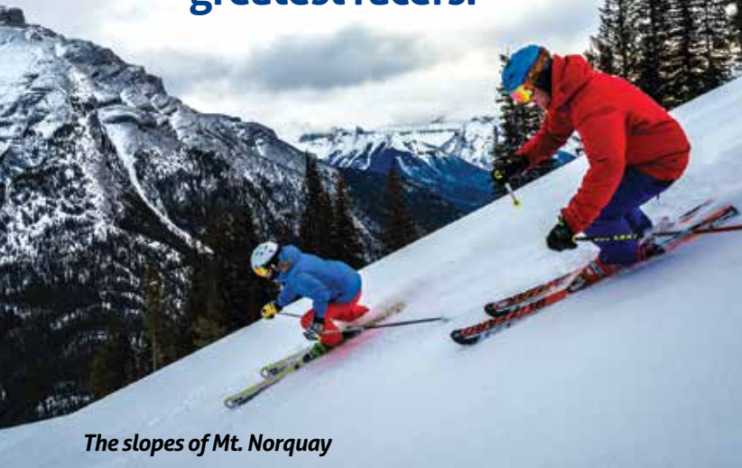
The slopes of Mt. Norquay

“Mt. Norquay has been the training grounds for some of Canada’s greatest racers.”