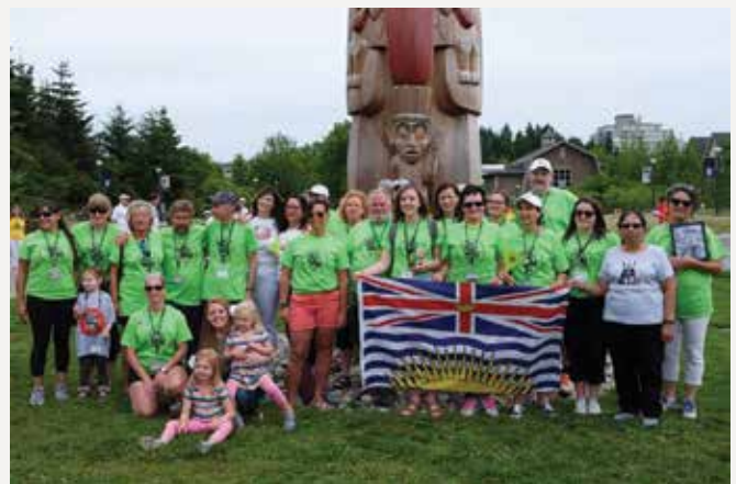
Living donors and donor families at the Reconciliation Pole

A donor walk was held to honour living donors and donor families at the Reconciliation Pole. So fitting, the story was given of the Pole's symbolism and the connection to organ transplantation. The week ended with a gala celebration which included guest