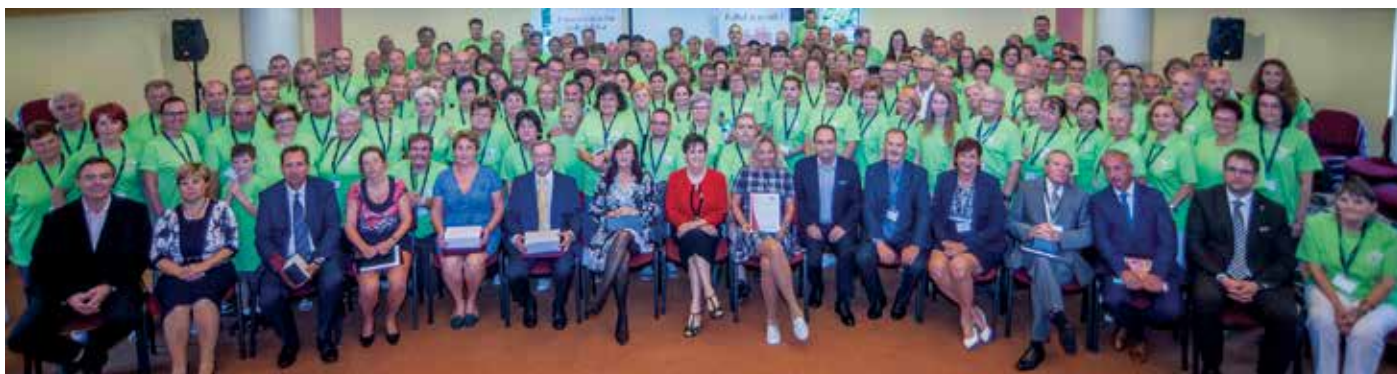
20th anniversary participants