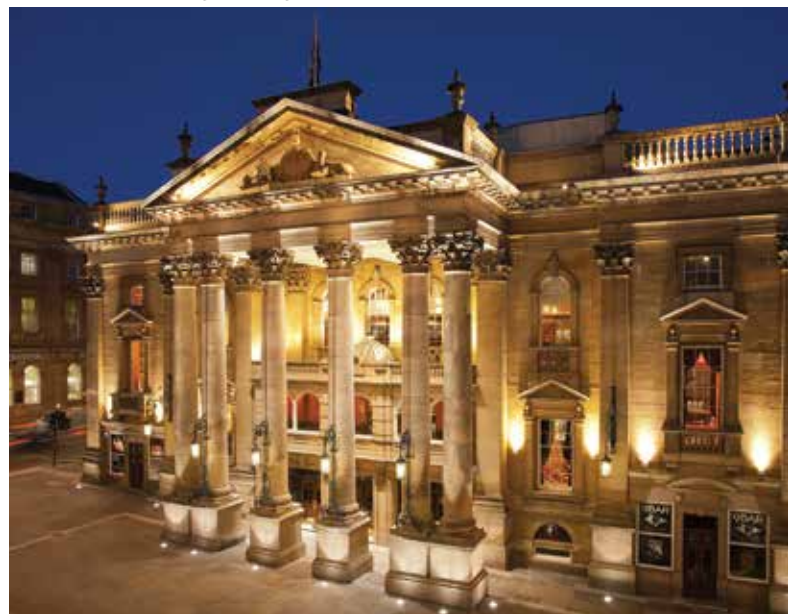
Below: Theatre Royal, Grey Street