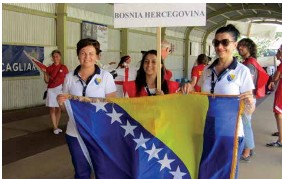
Team Bosnia & Herzegovina prepare join the Opening Ceremony

The main factor uniting both transplant recipients and people who are on dialysis is the desire to take a proactive role in