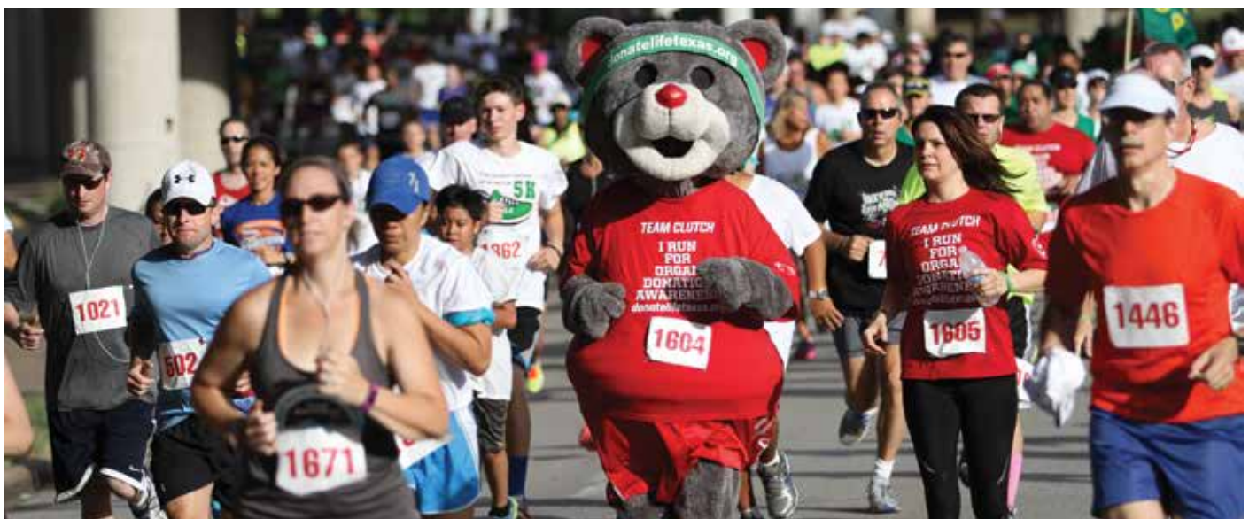
Transplant Games of America, Houston 2014