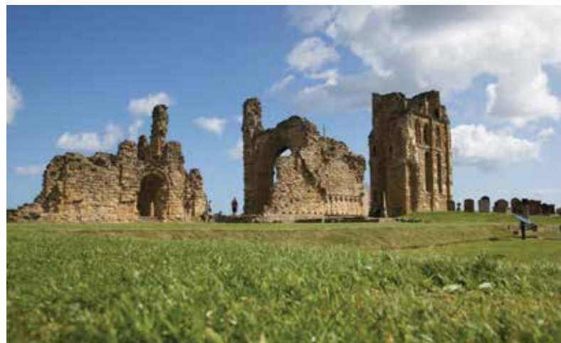
Above: Tynemouth Priory & Castle