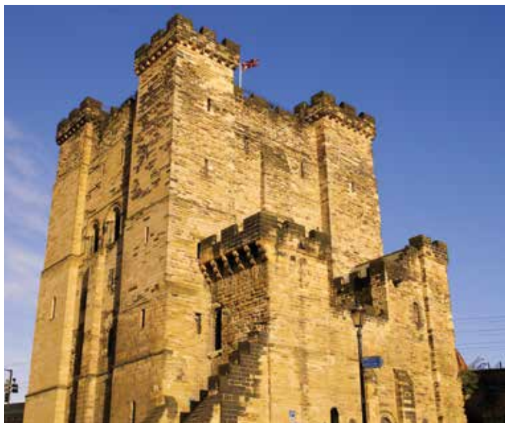
Below: Newcastle Castle