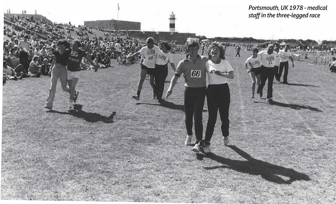
Portsmouth, UK 1978 - medical staff in the three-legged race