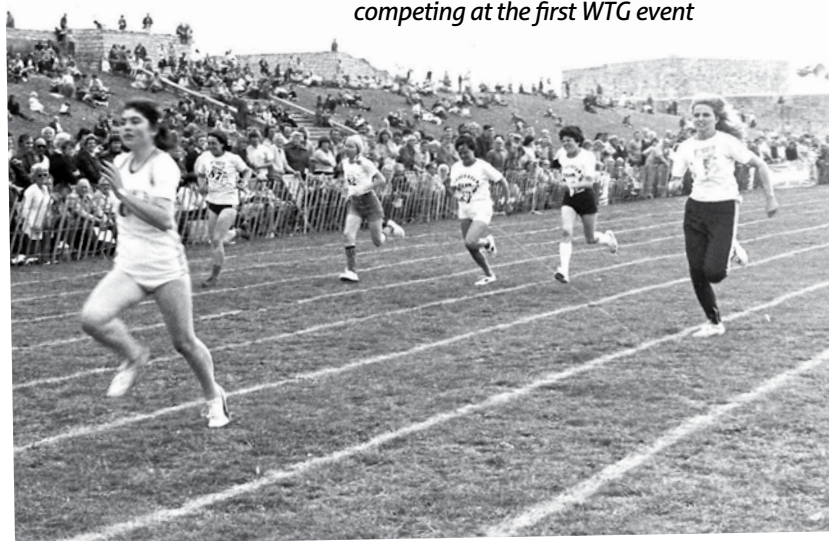
Portsmouth, UK 1978 - transplant recipients competing at the first WTG event