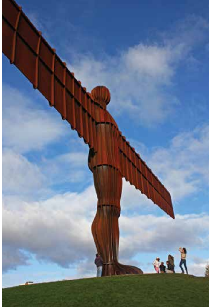
Angel of the North